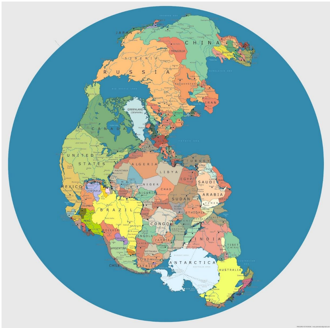
Picture: Massimo Pietrobbon https://commons.wikimedia.org/wiki/File:Pangea_political.jpg

At the start of the Triassic period all the continents were connected together creating a supercontinent called _____. This picture shows how today's countries would have fit into the supercontinent.